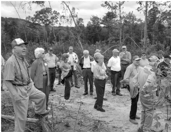
The North Carolina Tree Farm Program offers free workshops for landowners.