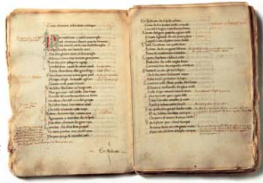
Hand-copied text on cloth rag paper from a 15 th century Italian manuscript

The Chinese invented the first true paper about 2,000 years ago. Their paper was made from a watery paste of ground-up mulberry bark, hemp, and cloth rags. They pressed this paste to remove the water, then sun-dried the resulting mat of compacted fibers to make a sheet