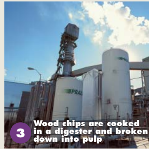
3 Wood chips are cooked in a digester and broken down into pulp