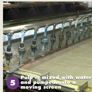
5 Pulp is mixed with water and pumped onto a moving screen