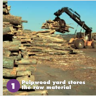
1 Pulpwood yard stores the raw material