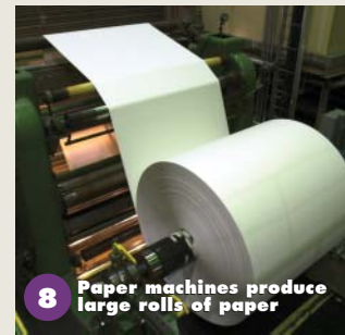
8 Paper machines produce large rolls of paper