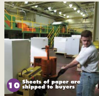
10 Sheets of paper are shipped to buyers