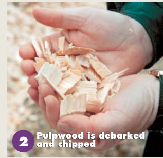
2 Pulpwood is debarked and chipped