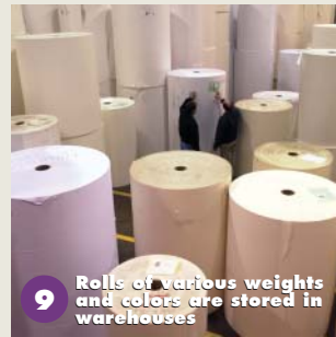
9 Rolls of various weights and colors are stored in warehouses