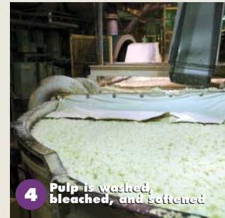
4 Pulp is washed, bleached, and softened