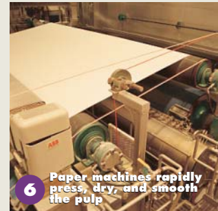
6 Paper machines rapidly press, dry, and smooth the pulp