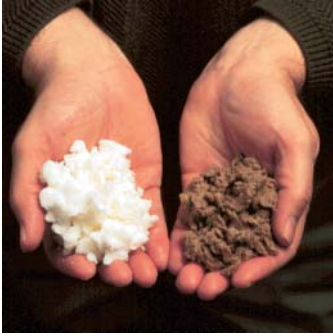
Naturally dark brown wood pulp (right) is useful for making paper bags and boxes. After bleaching and softening (left) pulp produces higher grades of paper and other products.

mill. Most of the trees used for papermaking in Pennsylvania are smaller trees that have little potential for making lumber. At the mill, the bark is removed from the trees.