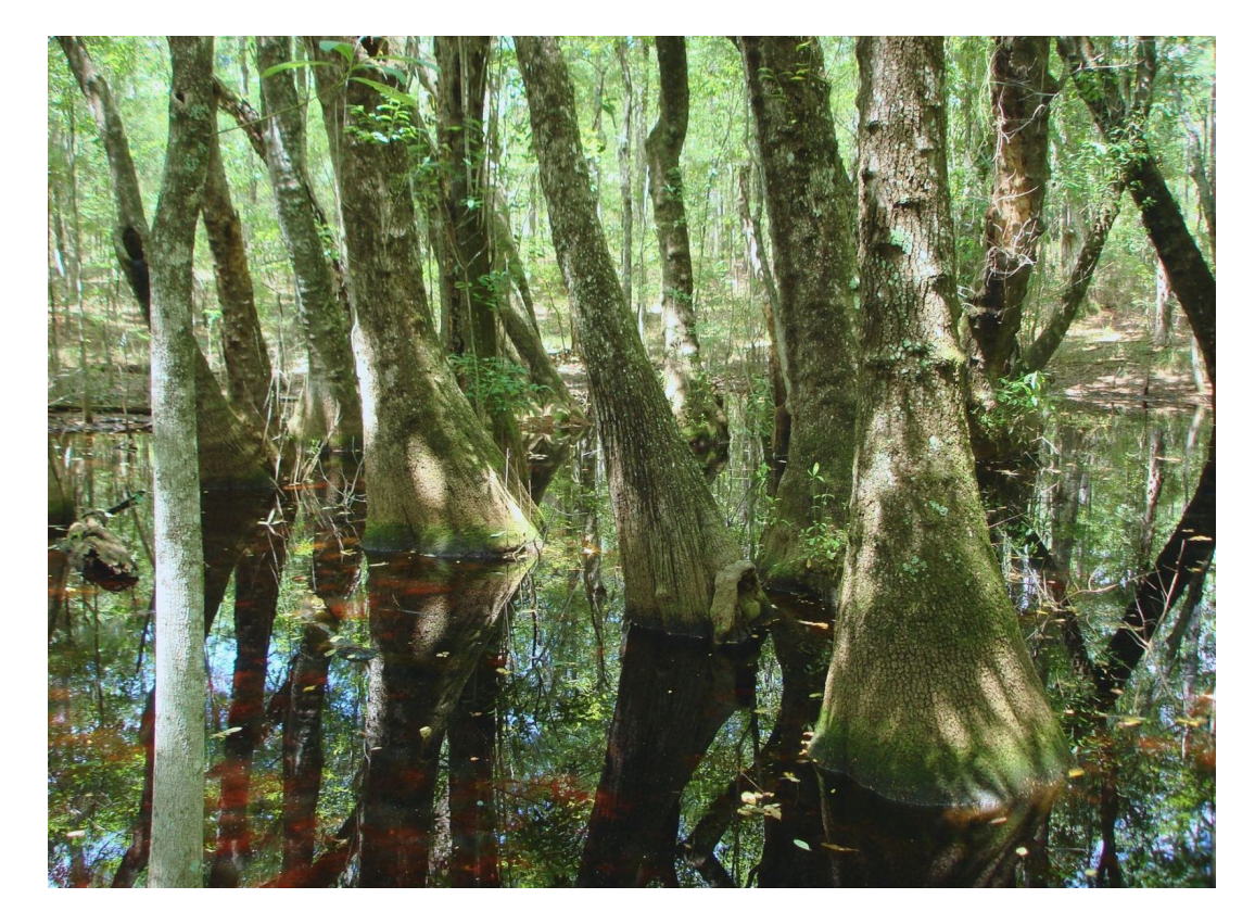
Figure 2. Bottomland forest during wet period.